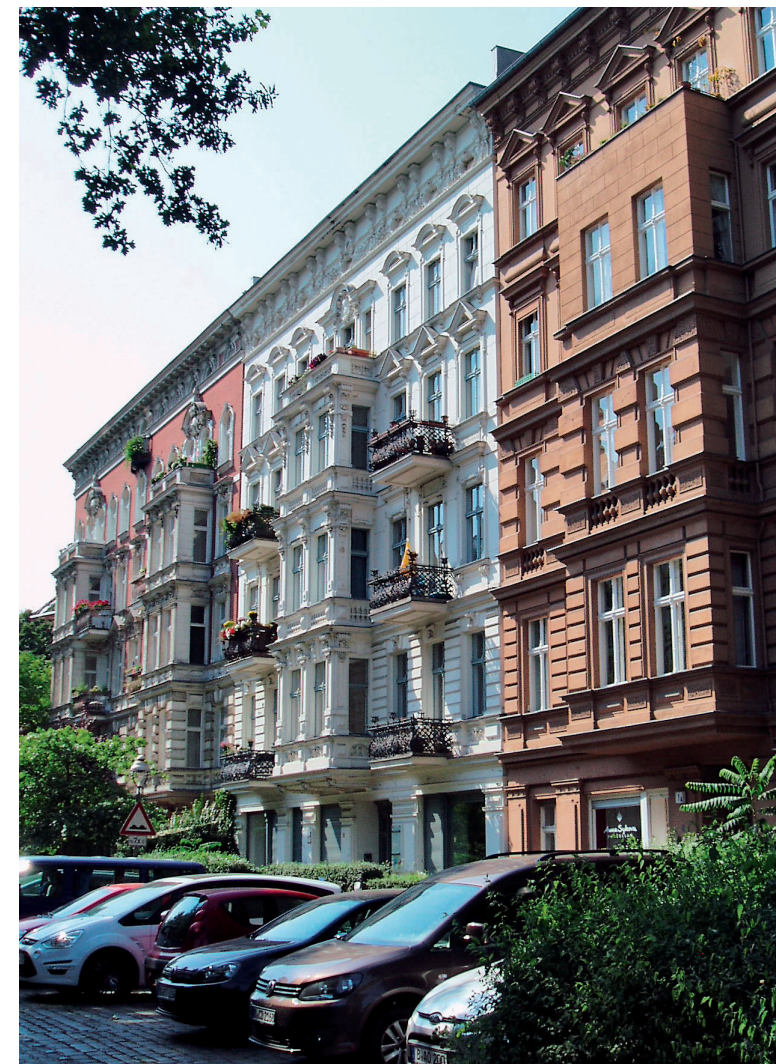
text: asum GmbH | design: Susanne Nöllgen | status: January 2023

Social conservation area “Graefestraße” Information for residents