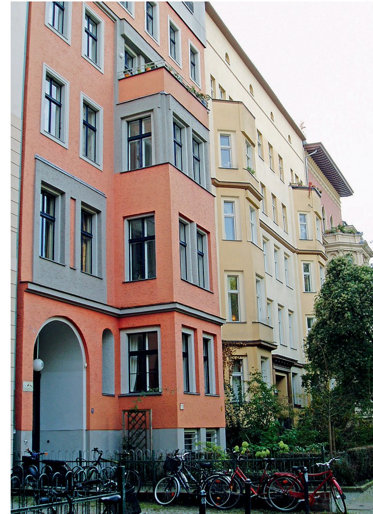
Text: sum GmbH | Gestaltung: S. Nölgen | status: January 2023

Social conservation area “Hornstraße” Information for residents