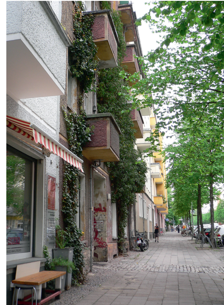
text: asum GmbH | design: Susanne Nöllgen | status: January 2023

Social conservation area “Petersburger Straße” Information for residents